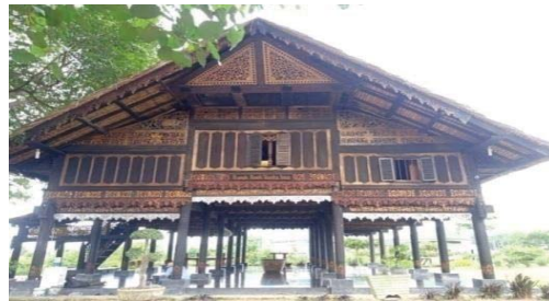
FIGURE 1. Acehese Traditional House

The Acehese traditional house is one of the traditional houses in Aceh province. Acehese houses are made using natural materials, such as wood, planks, bamboo, palm fiber, thatch leaves, and stones. This is because these materials are easy to obtain and durable. Even though it is made with the same material, the techniques for making traditional houses in each province in Indonesia are still different [18]. Acehese traditional houses are shaped like stilt houses and consist of several rooms, including seuramoe ukeu (front foyer), Rumoh Inong , which has two rooms, namely a girl's room and parents' room, seuramo likot (back foyer), and a kitchen. The construction of the Acehese house was carried out jointly by the craftsman ( utoh ) and other communities.